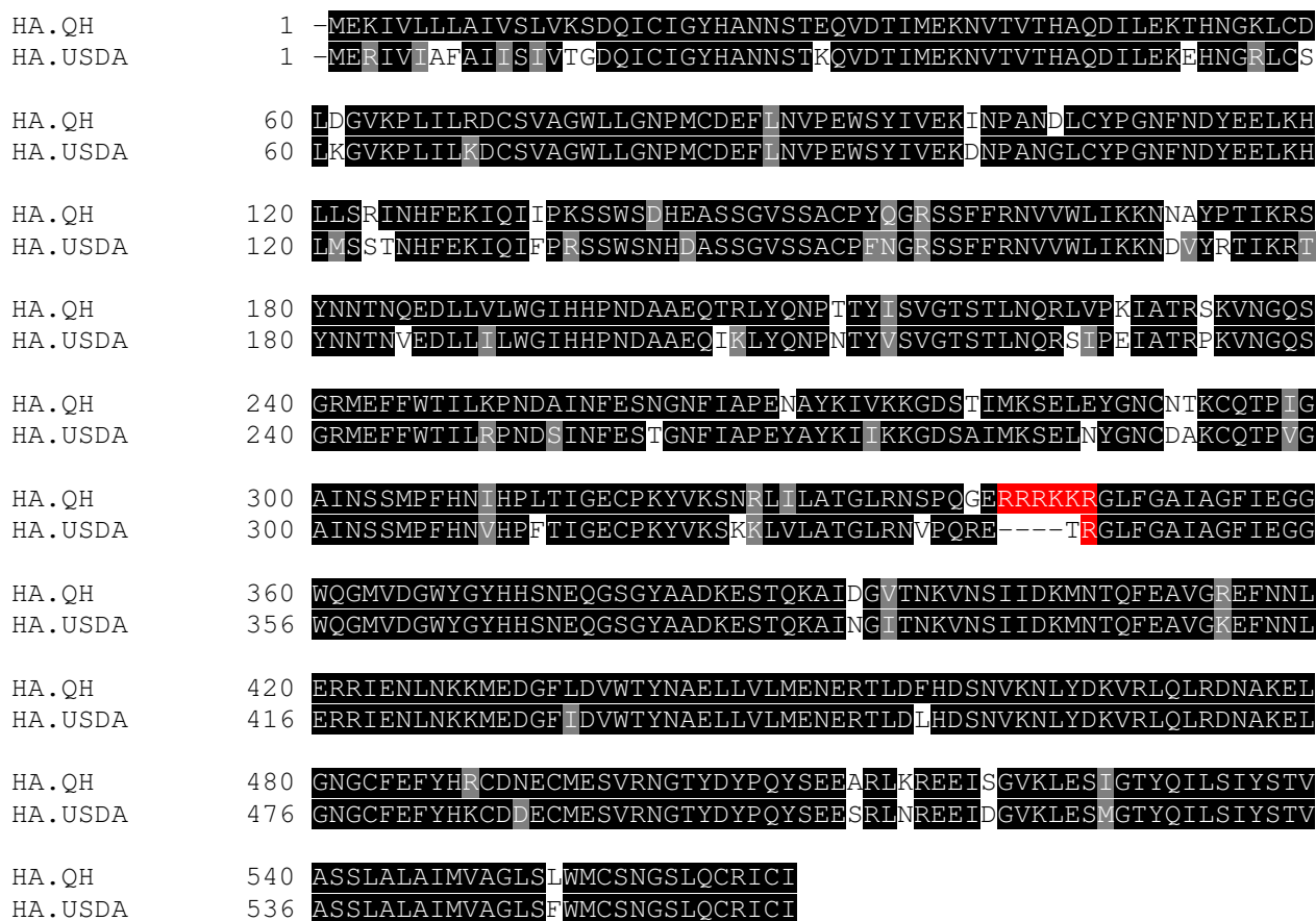
Figure 1 Sequence alignment of uncleaved low pathogenic H5N2 HA USDA and high pathogenic H5N1 HA Qinghai (QH). Amino acids implicated in cleavage of HA 0 into HA 1 and HA 2 are highlighted in red.

Previously, we developed an HIV-based pseudotyping system and demonstrated that a highly pathogenic H5N1 recombinant virus can enter human-derived cell lines more efficiently than avian-derived cell lines [10]. Having determined the tropism of this highly pathogenic H5N1 virus [11], we wanted to compare the differences at the level of entry with a low pathogenic H5N2 virus [9] utilizing the aforementioned pseudotyping system. This pseudotyping system allows us to safely and specifically study the HA protein of influenza A viruses at the entry level by incorporating the HA gene into HIV virion particles and using them for transduction to the target cells. Briefly, human embryonic kidney 293 T cells were co-transfected using PEI (Invitrogen) with a pNL4.3.R-E- plasmid carrying a luciferase reporter gene [12,13] and a pcDNA3.1 plasmid carrying the appropriate HA gene. Producer cells