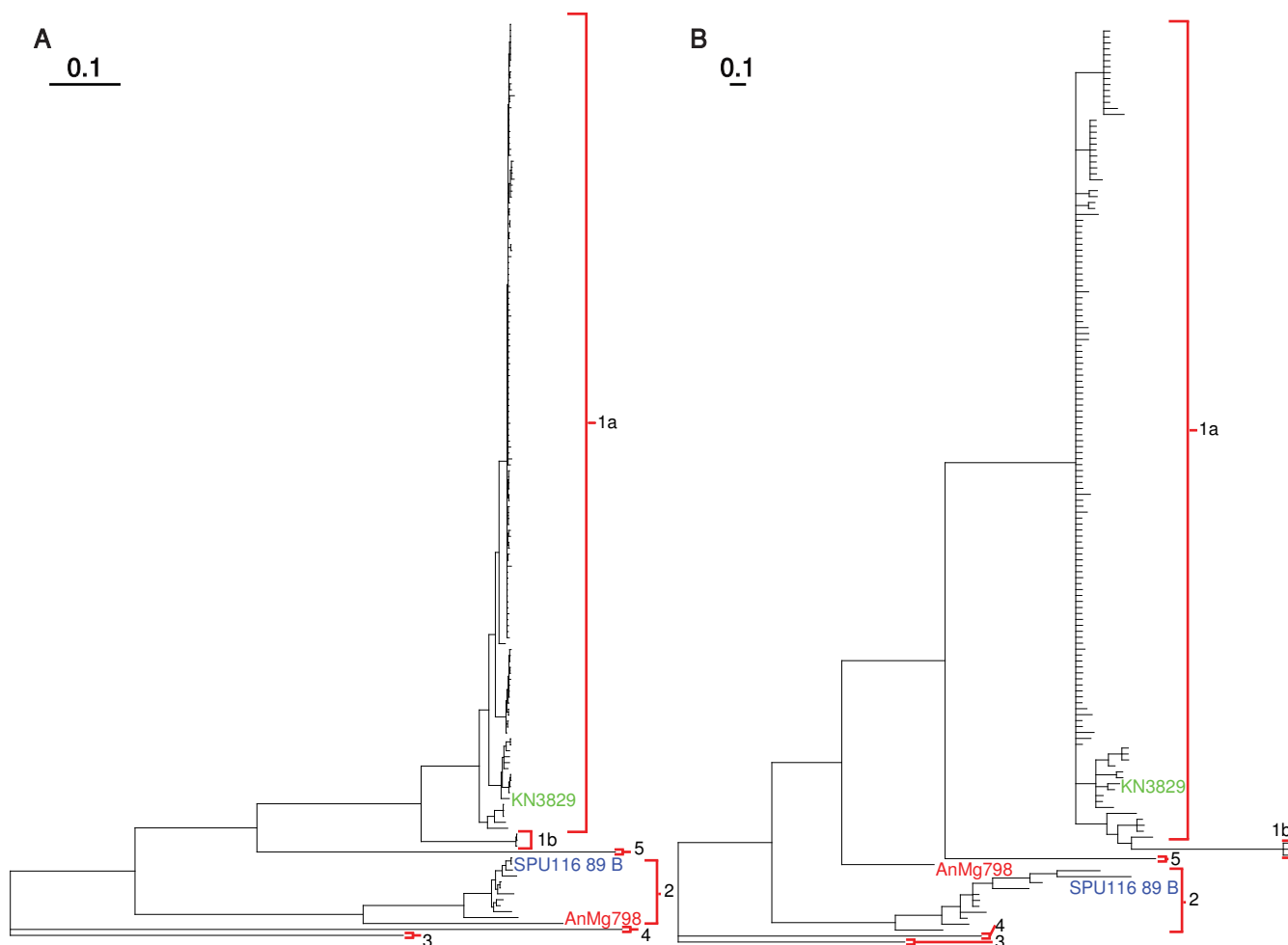
Figure 2 Phylogenetic Trees Showing Recombination. Shows the Bayesian consensus trees for (A) the NS5 coding region lacking the recombinant region and (B) only the recombinant region. The labels for all non-recombinant taxa were removed for clarity. The translocation of the AnMg798 sequence from the lineage 2 clade in panel A to the lineage 1a clade in panel B indicates the presence of recombinant sequence within this region. Major parent, minor parent, and daughter sequences are shaded in blue, green, and red respectively. Lineages are indicated as in figure 1. Branch lengths are proportional to distance (the number of nucleotide changes), and the distance scale for the number of changes is provided at the top each panel.

into the same territory as the other and would allow for co-circulation of both viruses within the local environment until they eventually infected the same host and the recombination event occurred. It is also impossible with the present amount of information to determine which organism was co-infected and produced the recombinant virus.