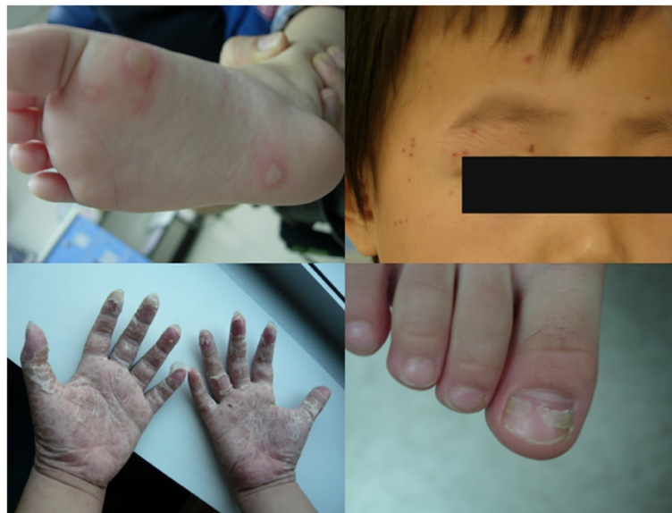
Figure 2 Dermatologic presentations of atypical HFMD. Erythema was frequently observed at the base of large vesicles. These lesions were distributed on limbs, trunks or perioral areas. (Top, left) Bullae were formed on a 5 year-old boy's sole, which caused mild pruritus and prickling sensations. (Top, right) Atypical rashes of CVA6 spread on a 4 year-old child's forehead and temporal area of the face. The lesions did not involve the cornea or conjunctiva. (Bottom, left) Late presentation of atypical HFMD, severe desquamation was presented on bilateral palms and soles of a 12 year-old boy. Ten days earlier, he had marked blisters on his bilateral limbs and scattered vesicles on his buttock, yet without fever or other systemic symptoms. (Bottom, right) Onychomadesis occurred on the 2 weeks post CVA6 infection.

The analysis of clinical presentations between two groups of skin lesions and between CVA6 and non-CVA6 infected patients are listed in Tables 1 and 2, respectively. Children with large vesicles were more frequently CVA6-positive (large vesicle group vs. small rash group: 90% vs.