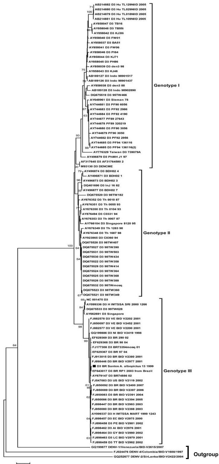
Figure 2 DENV-3 phylogenetic tree based on the NS5 partial gene sequences. The tree was constructed using the method of Neighbor-joining with 1000 bootstrap replications. The genotypes are labeled according to the scheme of Lanciotti in 1994 [14] and Amarilla in 2009 [15]. DENV-1, DENV-2 and DENV-4 were used as outgroup. Branch lengths are proportional to percentage of divergence. Tamura Nei (TrN+G) nucleotide substitution model was used with a gamma distribution (G) of 0.5121. Bootstrap support values are shown for key nodes only (values < 70% not shown). The strains isolated D3/BR/Santos/A. albopictus 13/1999 is marked with a filled square. The GenBank accession numbers, species, the country of origin, and year of isolation are shown.