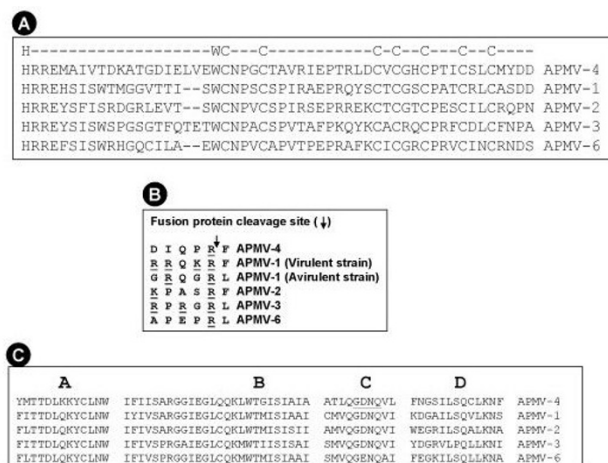
Figure 2 Amino acid sequence alignment of features of the APMV-4 V, F and L proteins compared with other members of genus Avulavirus. Sequence alignment of V protein C-terminal region (A), F protein cleavage site (B), and conserved domain III of L protein (C).

234. This protein is acidic in nature with a net charge of -5.696 at pH 7.0. The six conserved neuraminidase active residues were identified at positions 169 (R), 398 (E), 413 (R), 501(R), 529 (Y), 550 (E) along with 11 conserved cysteine residues (167, 181, 193, 233, 246, 339, 460, 466, 470, 534 and 545) corresponding to the globular head of HN protein [30]. Comparison of amino acid homology showed 30–32% identity within Avulavirus , 30–31% with Rubulavirus , 21–22% with Respirovirus , 15% with Henipa-